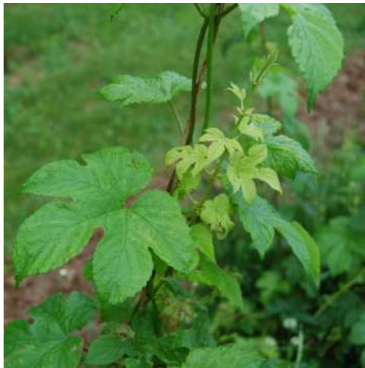
Image on the left. Photo from May 24. Shoot infected with downy mildew; note the yellowish appearance and downward-curling of the leaves. When flipped over, no sporulation was observed. Image on the right. Climbing bine that was infected with downy mildew, and has fallen away from the string. It will not grow further.

For further information on common diseases, insect and weed pest information, please consider the 2016 A3422 Commercial Vegetable Production in Wisconsin guide is available for purchase ($10) through the University of Wisconsin Extension Learning Store website: