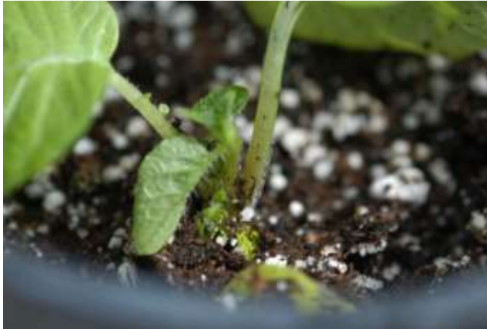
Figure 1. Sporulation (white downy growth) on stem above soil surface resulting from transmission of Phytophthora infestans from an infected seed piece (Photo Courtesy: Dr. Dennis Johnson, Washington State University).

9) If late blight is identified in a field, have a mitigation plan in place for specific site. Depending on days to vine kill, environmental conditions, and extent of infection –plan may vary from complete crop destruction to early vine kill with continued maintenance fungicide sprays. Mitigation plan should limit disease spread within field and from field – to - field.