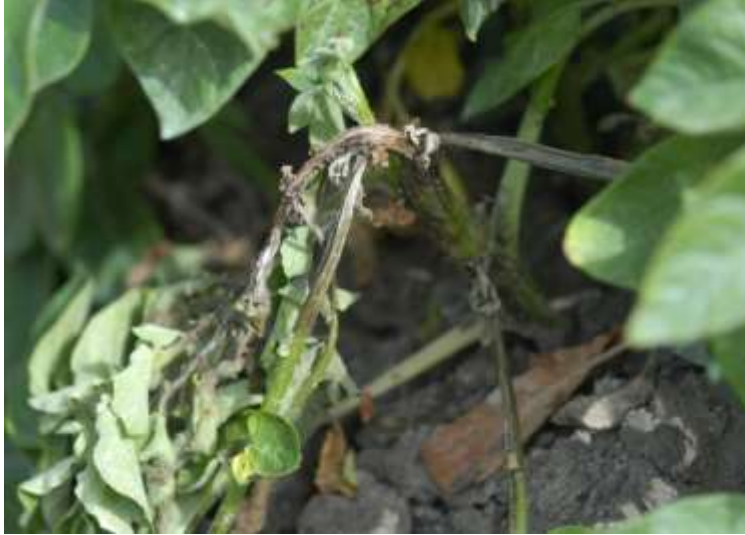
Figure 3. Late blight lesion on above-ground stem arisen from an infected seed piece planted in the field.

New ‘Focus on Potato’ Webcast Helps Users Minimize Spread of Blackleg (shared from Plant Management Network): Blackleg, caused by strains of soft rot bacteria known as Dickeya , has traditionally had little impact on North American potato production, but it now appears to be on the move throughout Europe and could increasingly threaten growers in the Eastern United States. The Plant Management Network (PMN) has released a new presentation entitled “ Dickeya : A Scottish, UK, and European Perspective” (link below) http://www.plantmanagementnetwork.org/edcenter/seminars/Potato/Dickeya/ to provide growers and crop consultants with an overview of the history of the disease in Europe and an introduction to Dickeya solani , a new aggressive pathogen strain contributing to the increase in incidence and spread of blackleg.