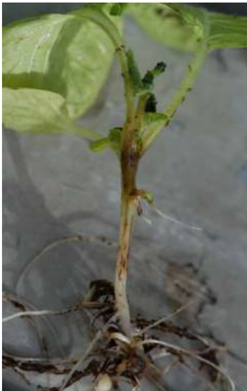
Figure 2. Streaking of reddish brown tissue on the below-ground stem where Phytophthora infestans moved internally in the below-ground stem from an infected seed piece to near the soil line and then formed a symptomatic lesion during a moist period. (Photo Courtesy: Dr. Dennis Johnson, Washington State University).