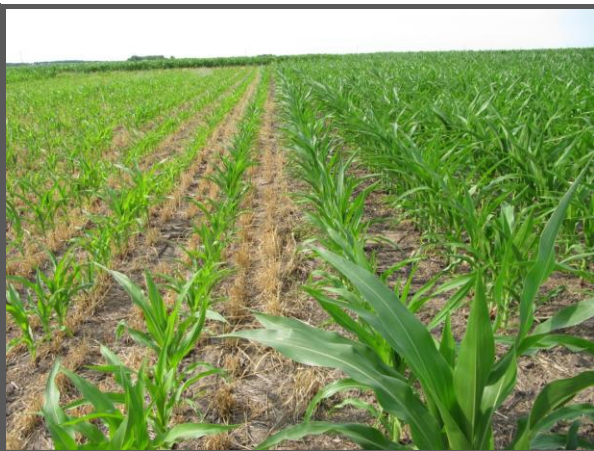
Figure 1. Green manure nitrogen credits for commonly used legumes in WI (Table 9.5 in A2809).